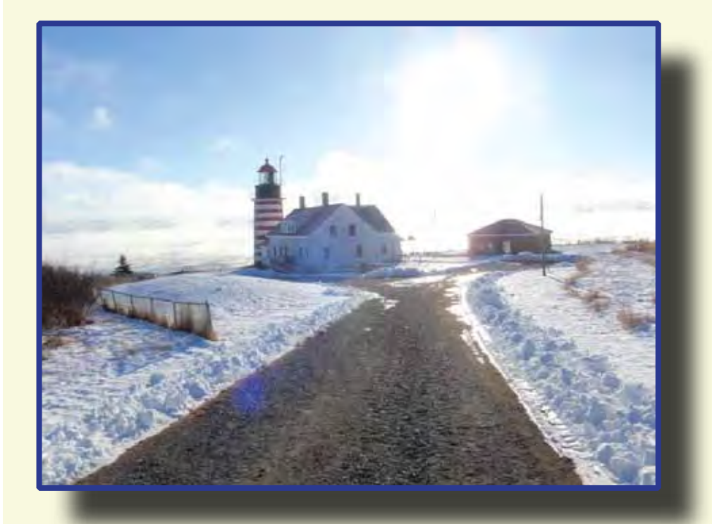
Photo 1: West Quoddy Head Light as seen from the South Lubec Road This is the first view of the lighthouse as one approaches on the access road.