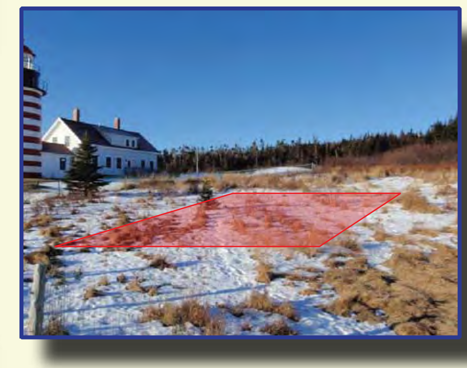
Photo 4: View of Proposed Memorial Site The area of the proposed memorial site as viewed from the east (shoreline) looking west toward the parking area and access road.