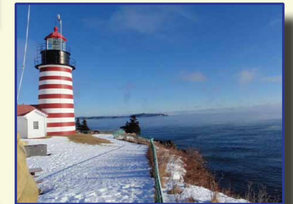
Photo 2: West Quoddy Head Light and Liberty Point on Campobello Island

The proposed location for the FDR memorial statue lies approximately 100 feet north of West Quoddy Head Light. The area is currently cleared land with views of both Campobello and Grand Manan Islands. The area will require landscaping work to prepare the site.